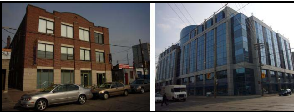
Two of CAMH's temporary off-site locations: 862 Richmond Street West (above left) and 901 King Street West (above right)

A highlight is the 60-bed Client Care Building (shown above), which will serve CAMH's Geriatric Mental Health, and its Child, Youth & Family Programs. This phase also includes a new outpatient and administrative centre, a building that combines a new central plant, parking garage and gymnasium, and a series of attractive tree-lined boulevards that will define the emerging urban village. Construction of this phase, which begins with the demolition of the existing Administration Building, will commence in January 2010 and conclude in the fall of 2012.