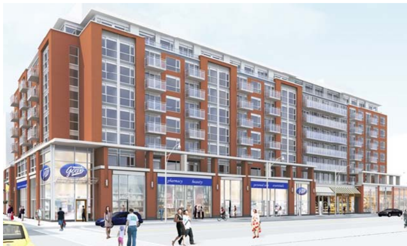
The first non-CAMH building will be at the southwest corner of Queen Street West and Ossington Avenue. This image shows an artist rendering of the building viewed from the northeast.

If you are interested in renting one of the units in this new non-CAMH building, you can leave a message at 416 486-4270, extension 2502, or you can fill out an online application form at http://www.verdiroc.com/CAMH/CAMHapply.html .