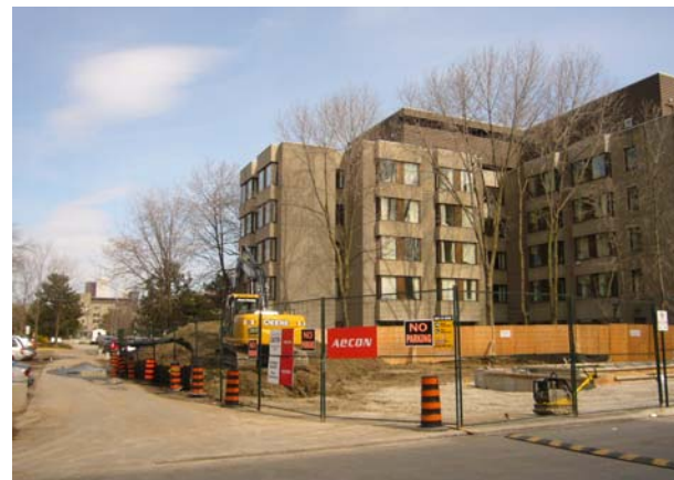
Above: The temporary hydro substation is being constructed next to CAMH's Unit 1. It is expected to be operational in September of this year.

The next step in these enabling works is the extension of municipal services (e.g. storm and sanitary sewers) into the site along the right-of-way of future Gordon Bell Road. The storm sewer will be located about 8 meters (25 feet) below the finished surface of the road and major excavation work is required to facilitate the installation of the sewer. This excavation will require the temporary closure of CAMH's West Driveway and the temporary loss of about 40 parking spaces in the west lot.