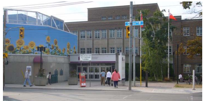
Above: CAMH's existing Administration Building, the Workman Theatre is at left.

In October of this year, CAMH's Queen Street site will begin to function much differently with the closure of the Administration Building and the relocation of the Main Entrance to Unit 4 (circled in green on the map above). Workman Arts will relocate temporarily to 651 Dufferin Street in April — Workman's temporary new space at St. Anne's Parrish includes theatre space. New signage will be installed on the site to assist in wayfinding. Finally, CAMH's administrative offices will be moving off-site to 901 King Street West until the completion of the Phase 1B project (Fall 2012).