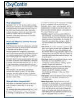
Straight Talk Pamphlet Series