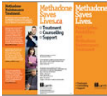
Methadone Saves Lives