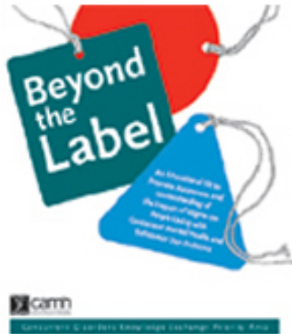
Beyond the Label: Impact of Stigma